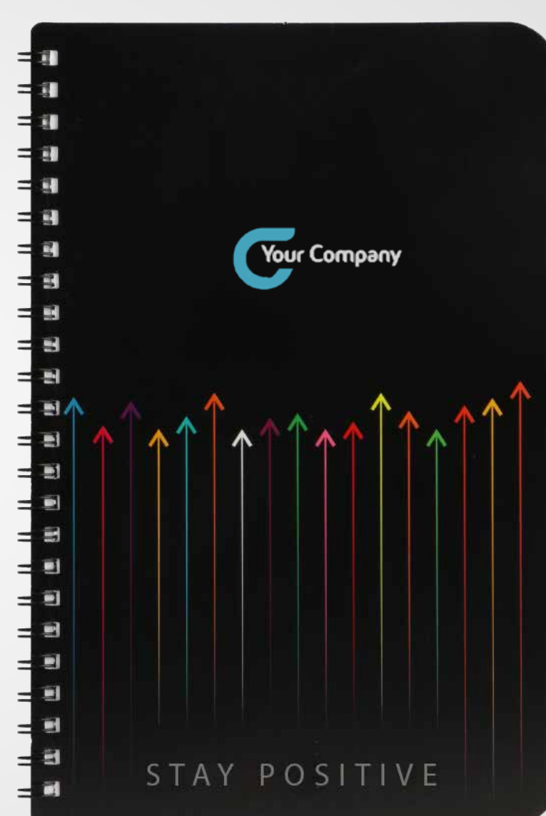
Screen Printing ( Maximum 2 Colour )