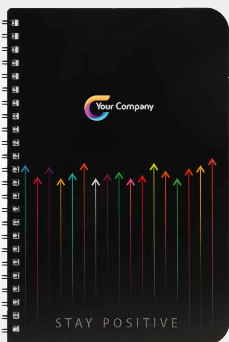
UV Printing ( Multi Colour )