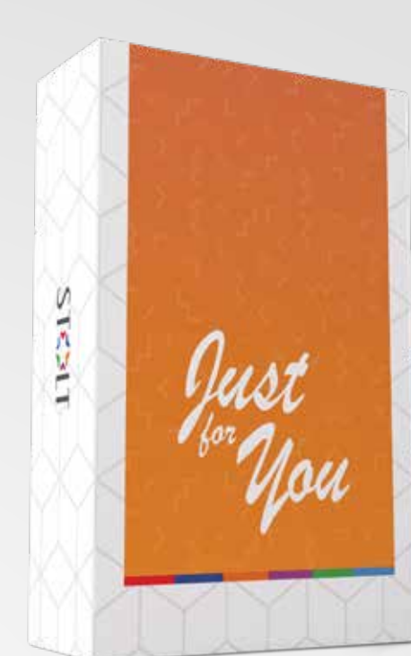
Pack Of 12 No.s