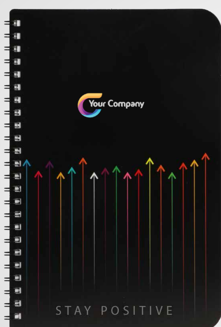
Sticker Printing ( Multi Colour )