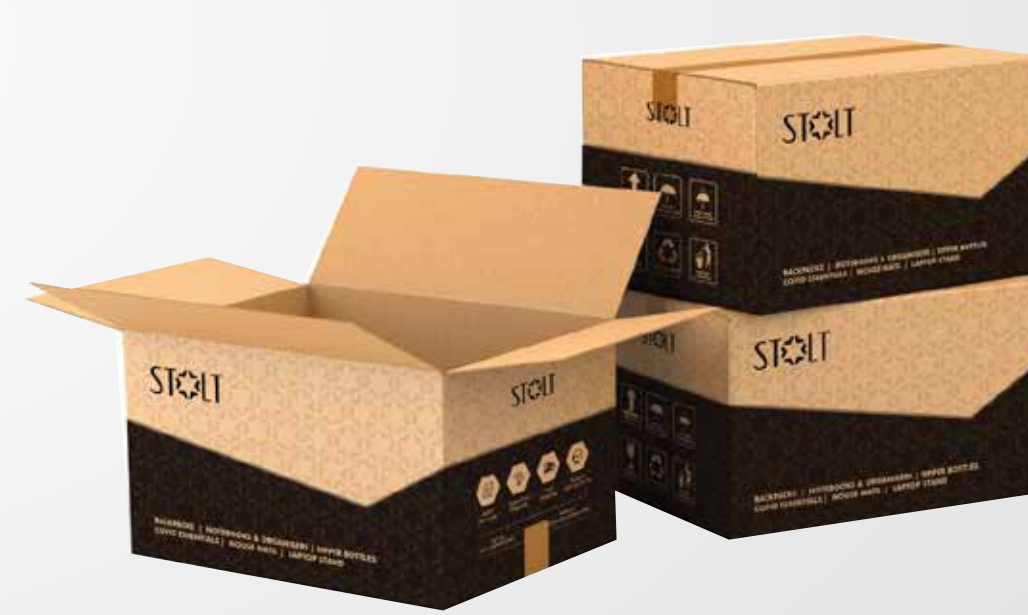
Carton Box For Damage Free Delivery