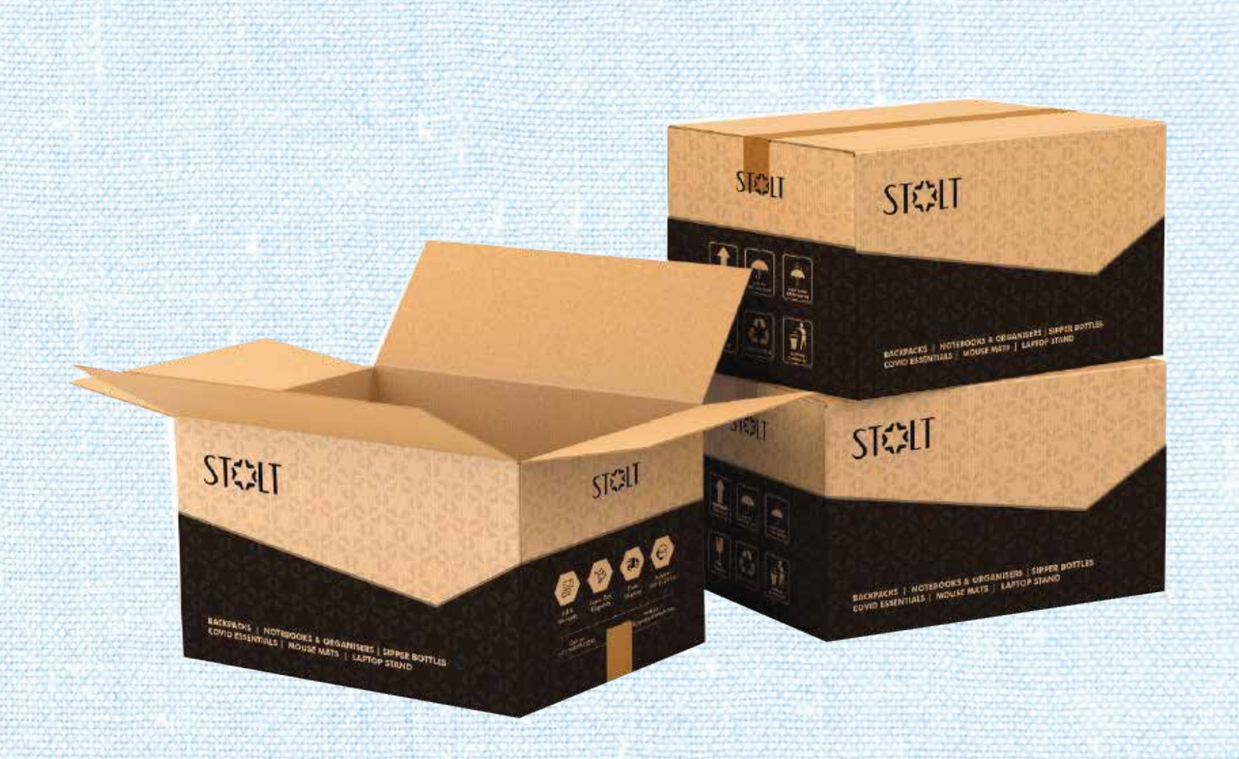
Carton Box for Bulk Orders