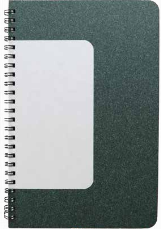
Green With White