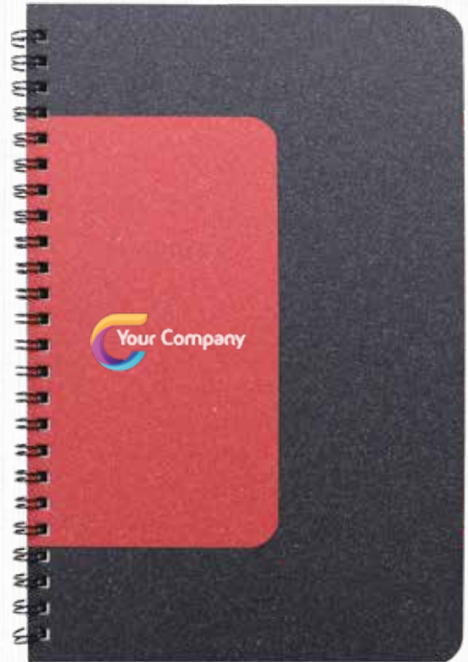
UV Printitng ( Multi Colour )