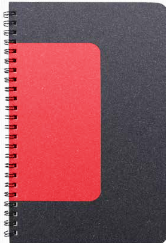
Grey with Orange