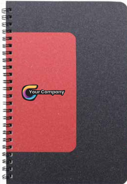
Sticker Printing ( Multi Colour )