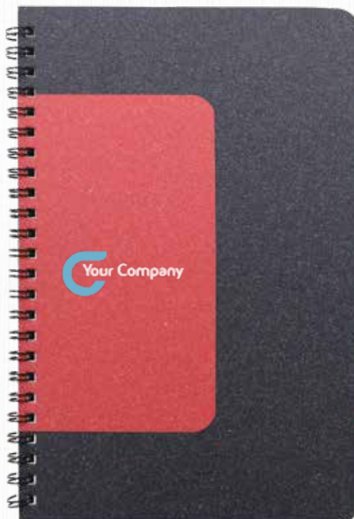
Screen Printing ( Maximum 2 Colour )