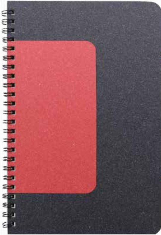
Grey with Red