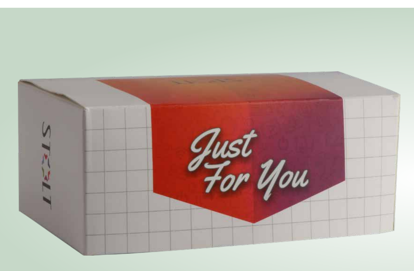
Set of 50 Packaging