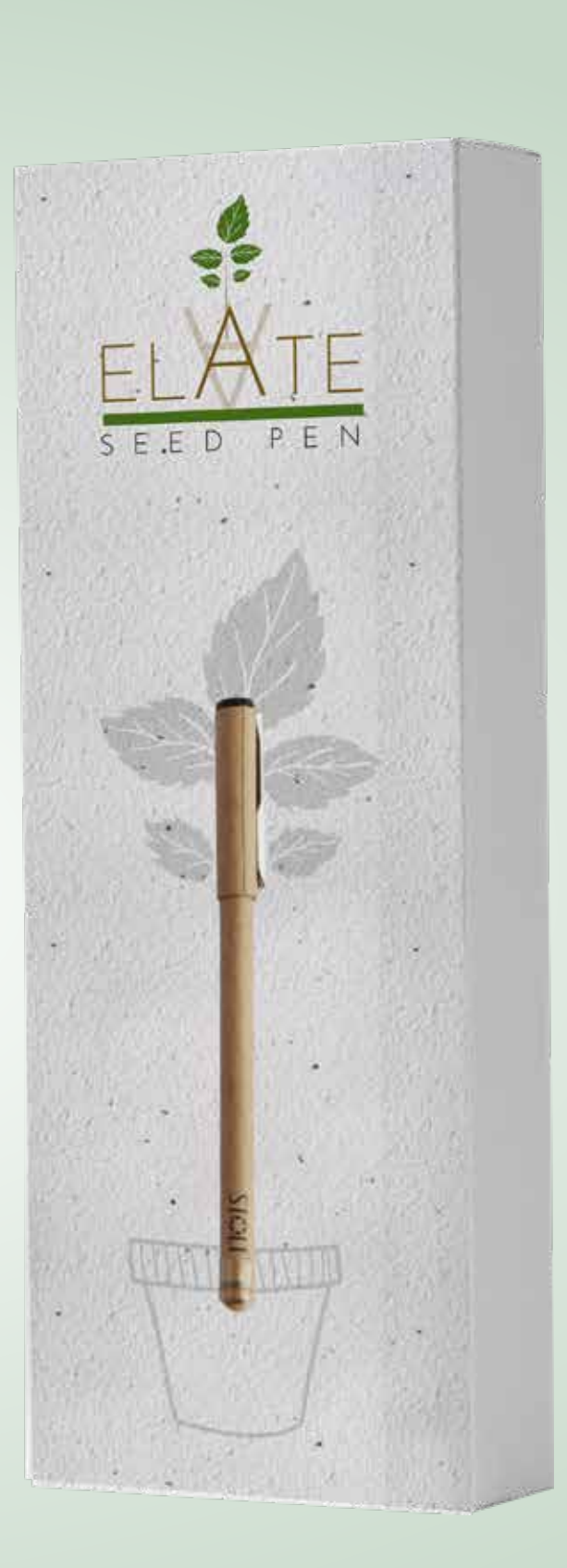
Pack of 10