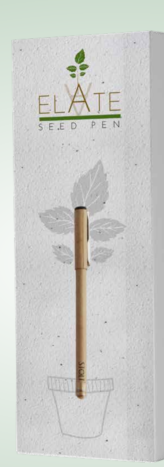
Pack of 5