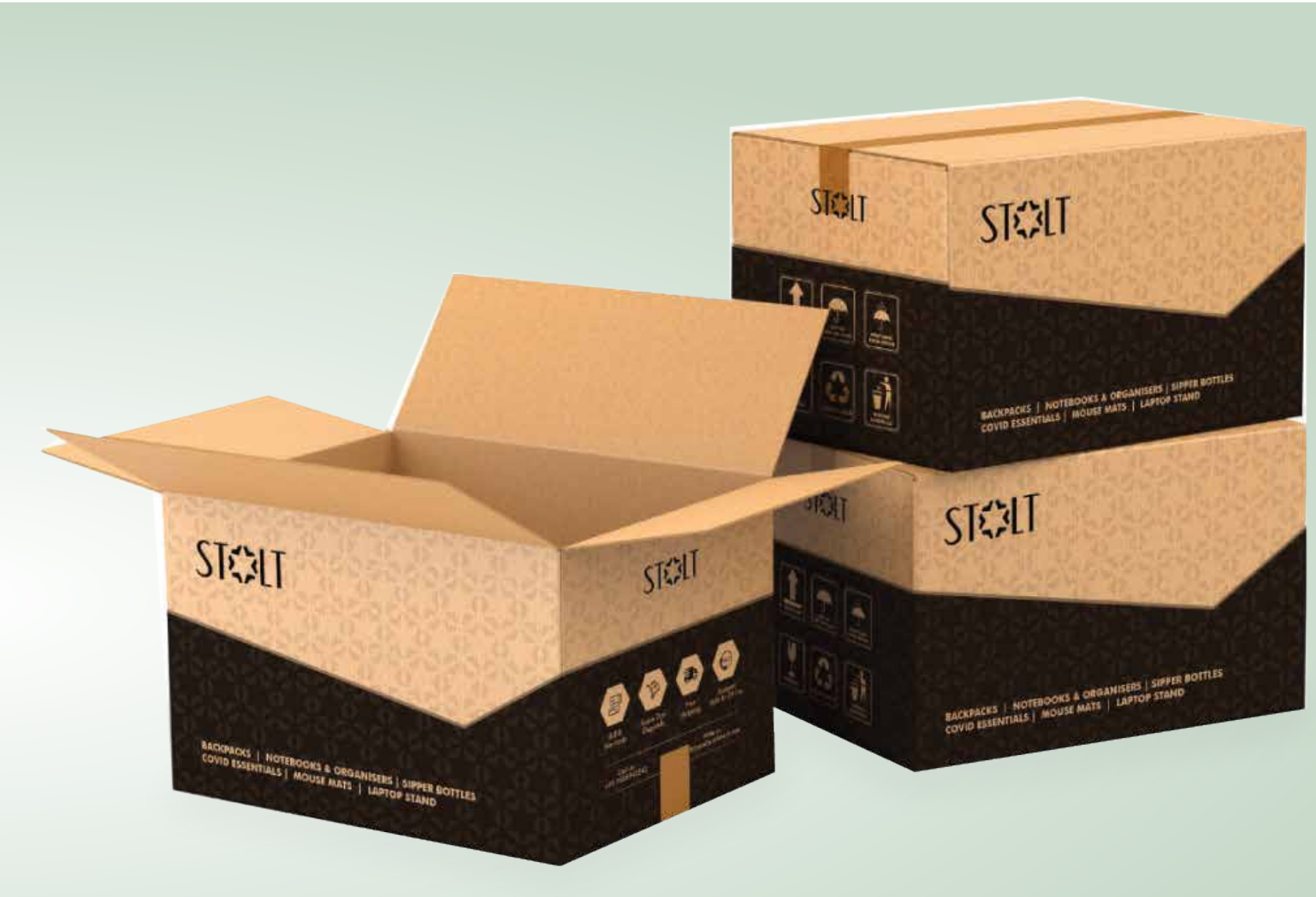
Carton Box For Damage Free Delivery