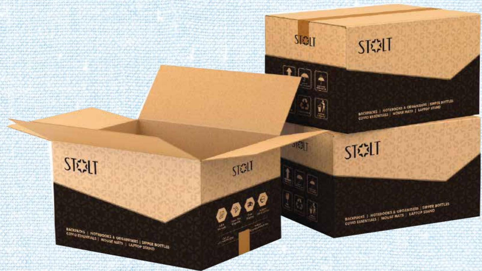
Carton Box for Bulk Orders