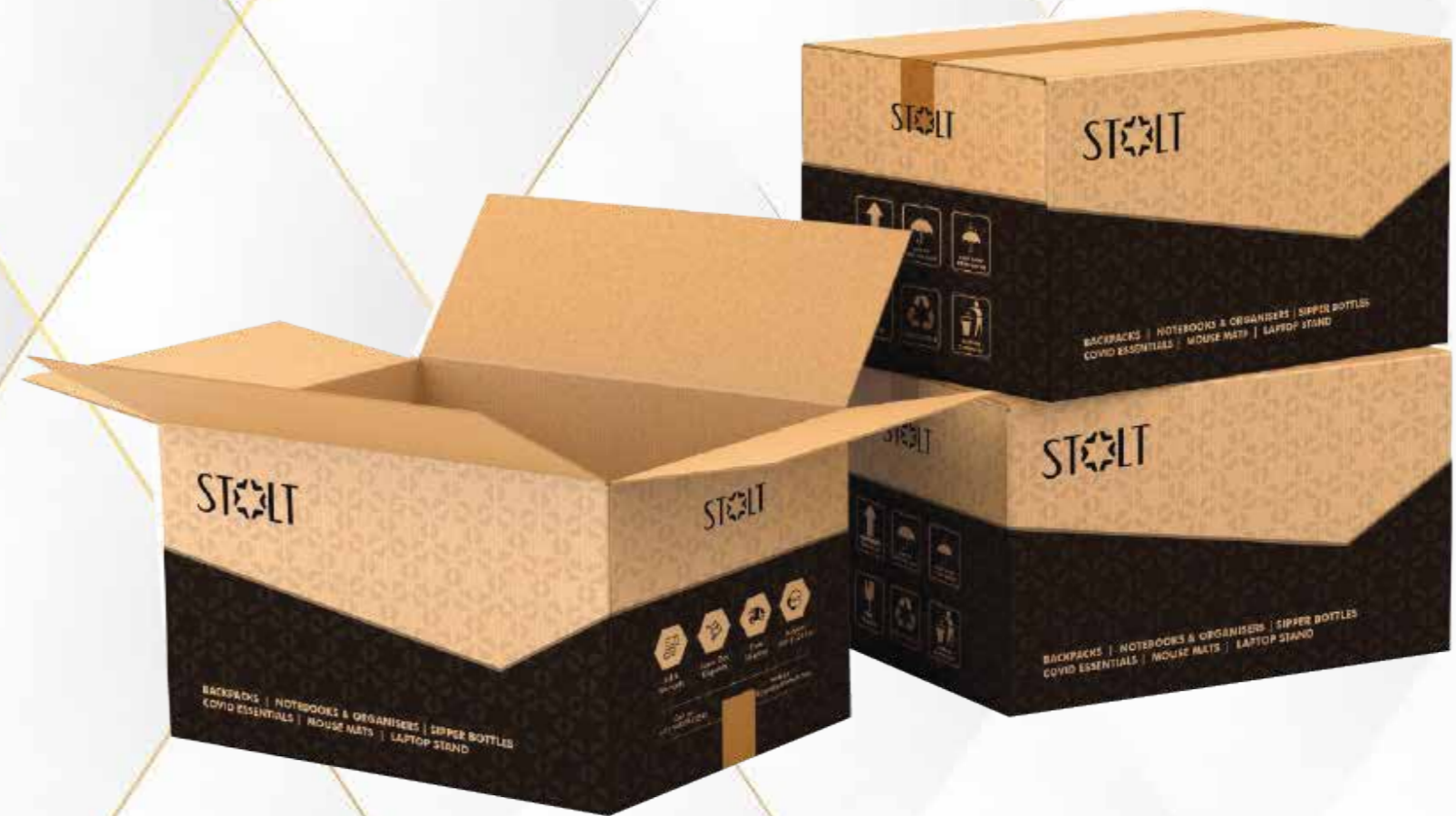
Carton Box for Bulk Orders