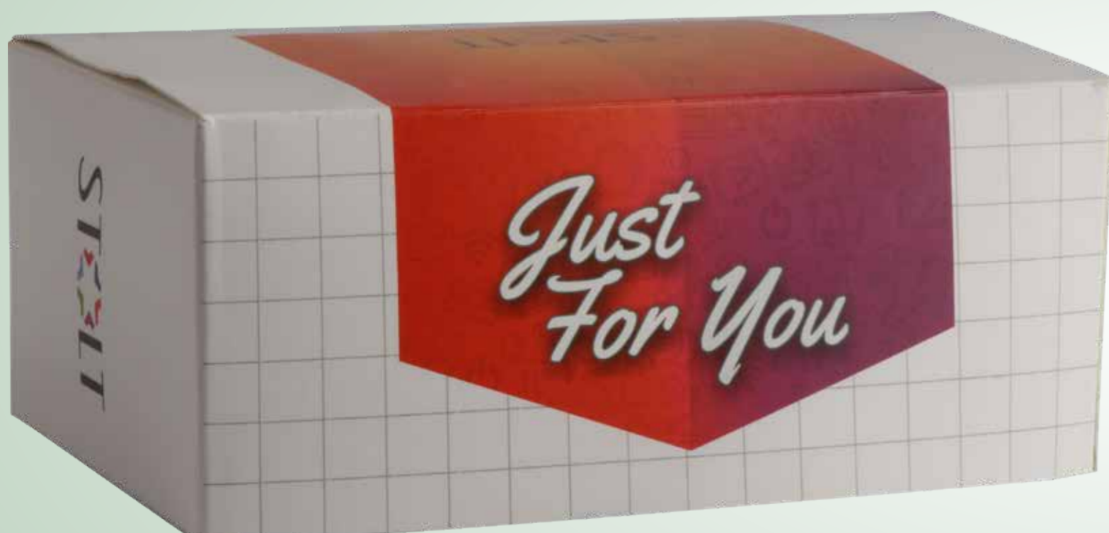
Set of 50 Packaging