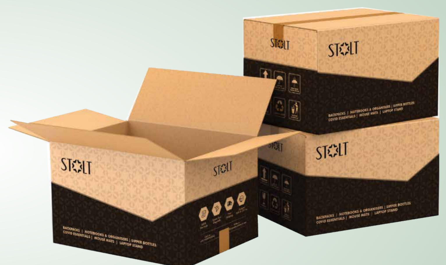
Carton Box For Damage Free Delivery