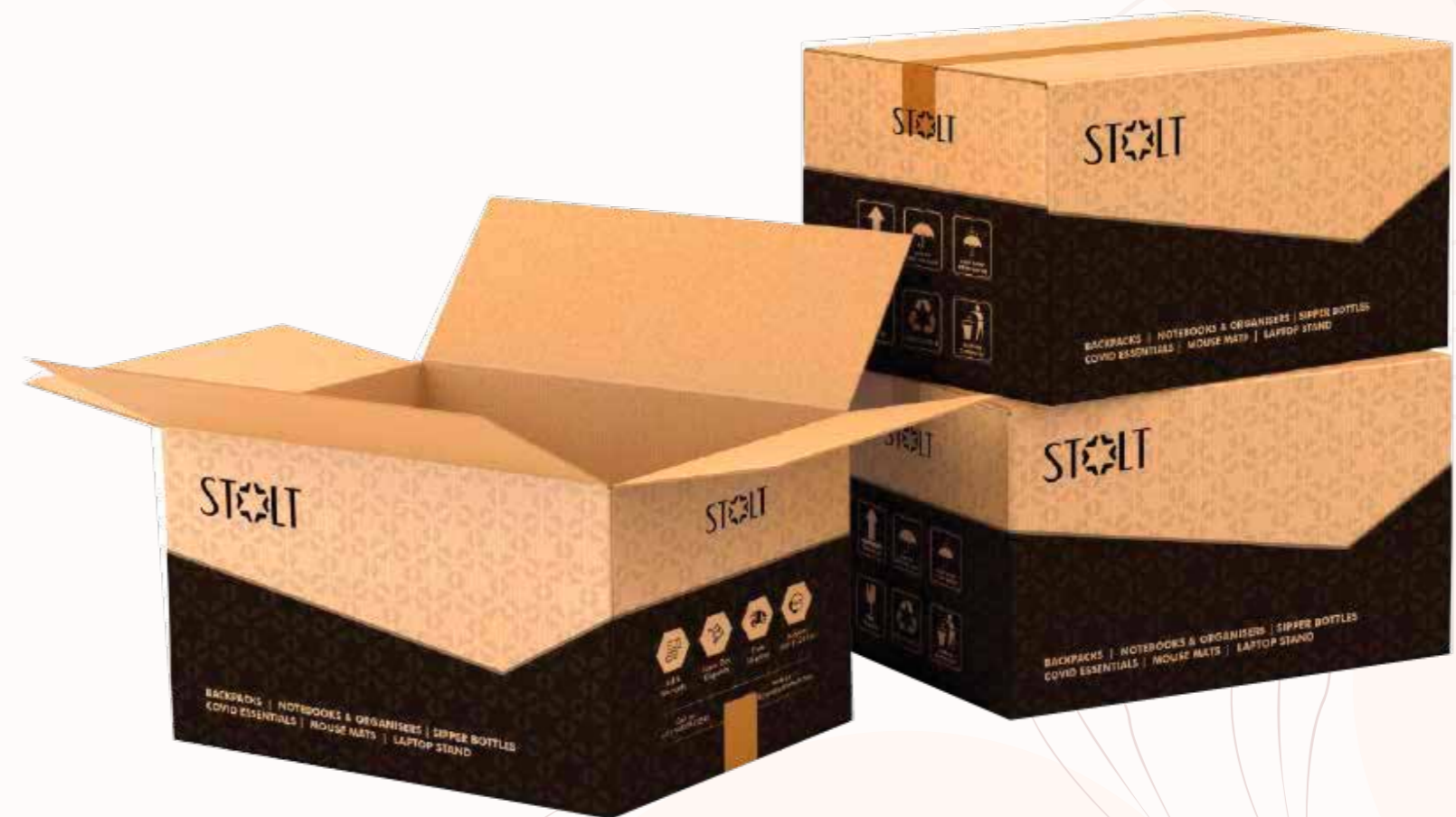
Carton Box for Bulk Orders