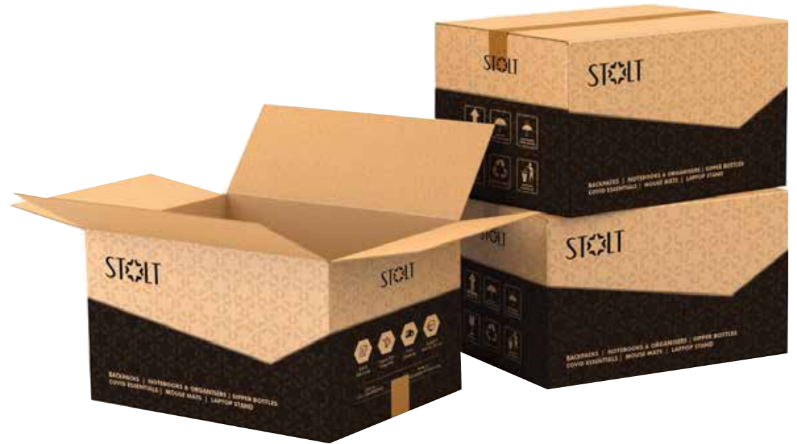
Carton Box For Bulk packaging