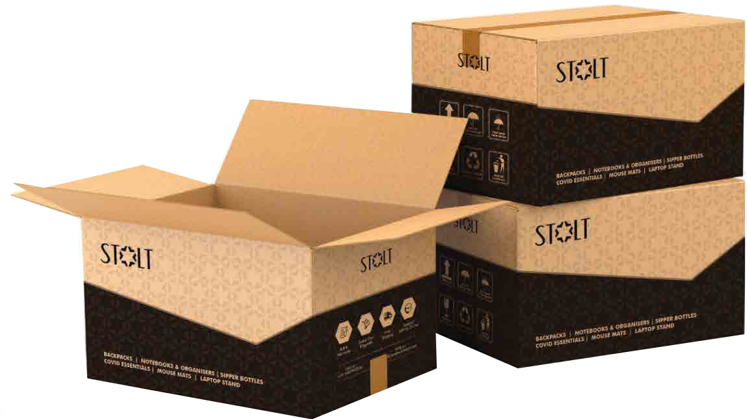
Carton Box For Bulk packaging