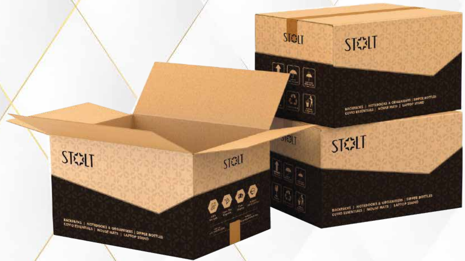
Carton Box for Bulk Orders